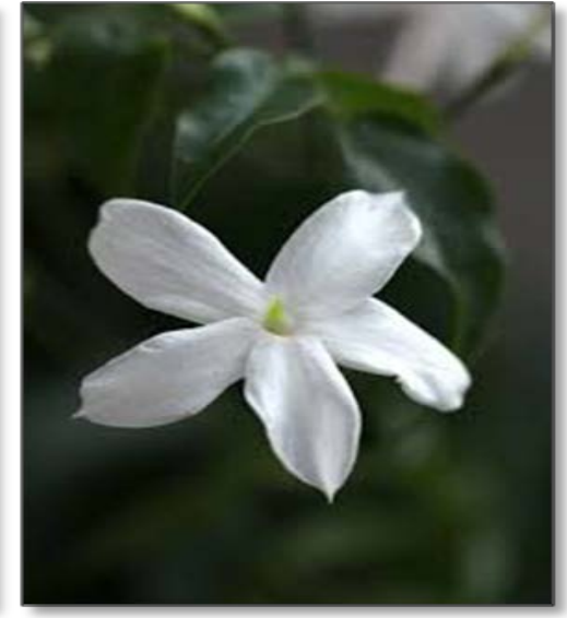
Fig. 11: Jasminumofficinaleplant